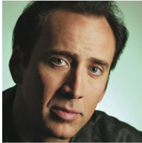
Nicolas Cage talks about movies, his family and his passions.

http://www.nationalledger.com/artman/publish/article_27266980.shtml